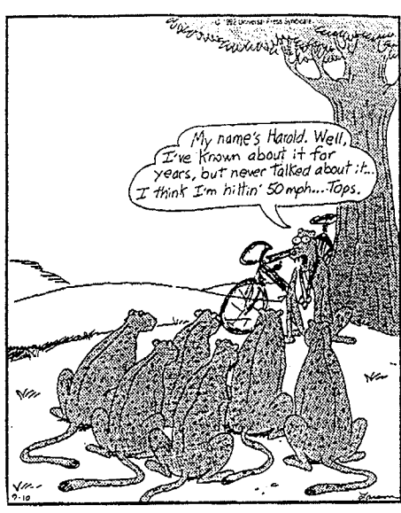
At Slow Cheetahs Anonymous