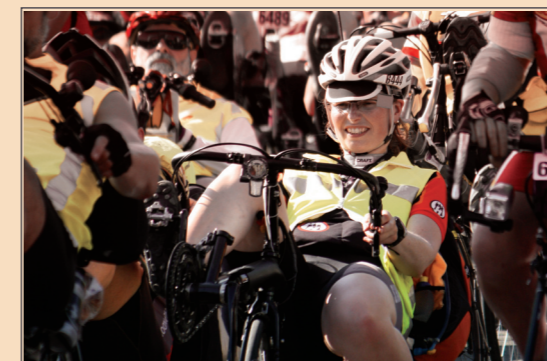
The calendar of the French and international BRMs is available on the PBP Web site: www.paris-brest-paris.org